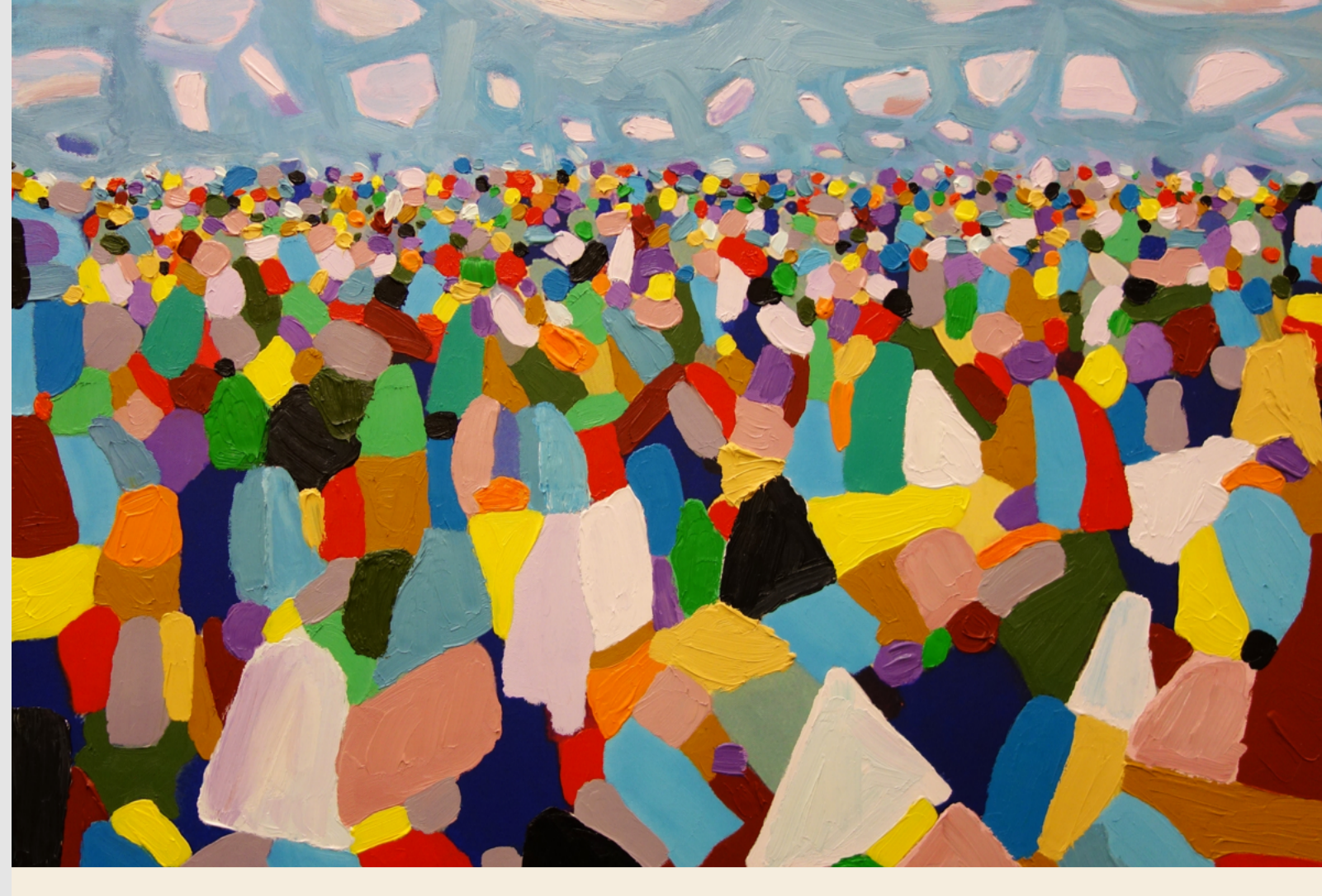
The Australian Crowd, by Stephen Baxter (2014)

The NCB News is the monthly newsletter of the National Centre of Biography. Got biographical news to share? Send us an email at ncb@anu.edu.au .