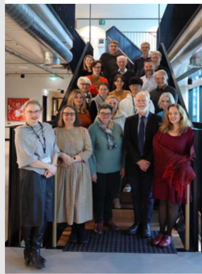
NCB staff and the ADB editorial board, May 2024

Every day in the NCB corridor you'll find our research editors hard at work fact-checking the latest ADB entries while in pursuit of that perfectly crafted sentence.