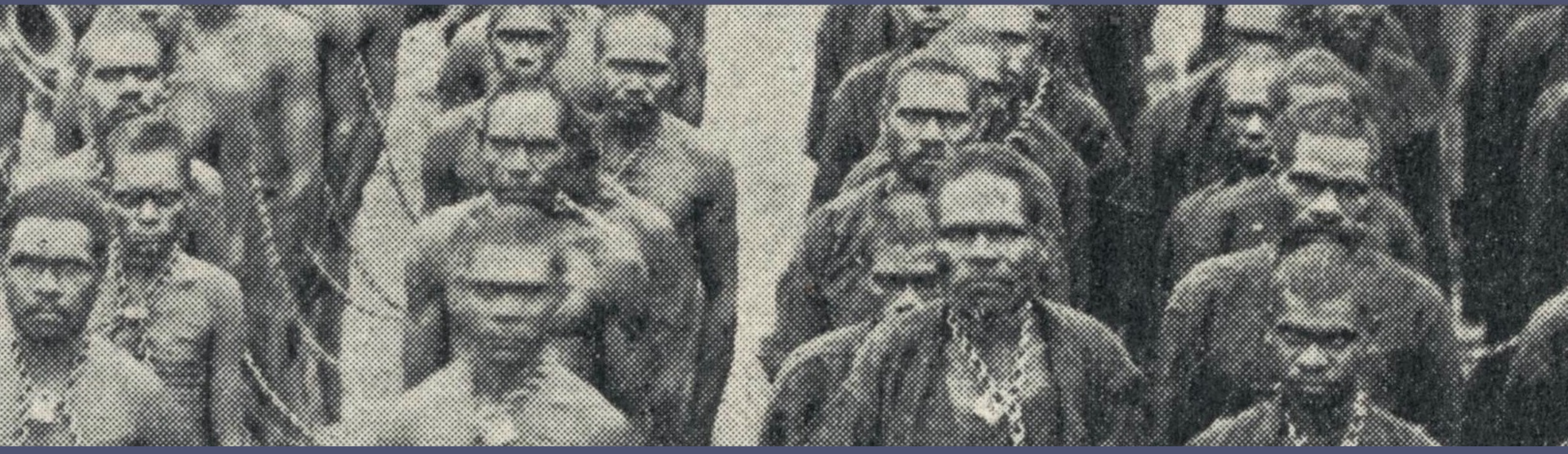
'Aboriginal bathing gang', 'The Aborigines question', The Western Mail, illustrated supplement, 18 February 1905, p. 24.

Western Australian Legacies of British Slavery explores links between slavery in the British Empire and settler colonialism by tracing the movement of capital, people and culture from slave-owning Britain to Western Australia (WA).