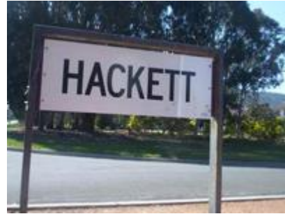
sign for the suburb of Hackett, Canberra

The competition is open to schoolchildren living in the inner north Canberra suburb of Hackett and has as its topic 'The person after whom your street in Hackett is named'.