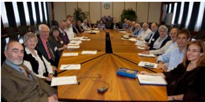
Participants at the workshop on the future of the ADB

The issue for us is to recognise and celebrate an achievement that we can all be proud of. An achievement that illustrates, demonstrates and educates simultaneously. Geoffrey Blainey said, in that context, that 'The Australian Dictionary of Biography will probably be the most valuable reference work in Australian history; it is already one of the most readable works on Australian history'. All of those are important comments. They all position the ADB and position it well. Those sorts of attitudes are the sort of attitudes that drive ADB staff, Working Parties and authors forward to make sure that this is a continuing work, that it will continue for as far ahead as we can see.