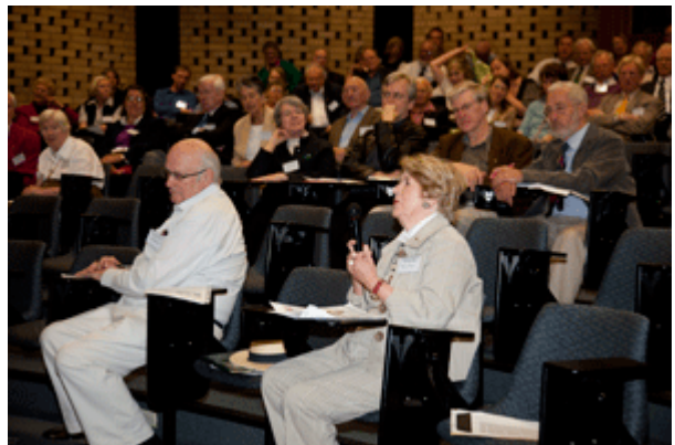
Audience at ADB Symposium 'Between the Past and the Future'

Novelists like Thomas Keneally openly admit to 'plundering' its narratives for their own work while George Johnston said The ADB is 'a gallery of very well-rounded portraits, often carefully considered with psychological insight, which are far removed from the usual dried-up biltong of most biographical compilations'. Peter Corris commented that 'The Australian Dictionary of Biography continues to be one of the ever-shrinking number of things Australians can be proud of'. That's a bit depressing really. I don't think that's really true. We've always got the Sydney Swans [laughter] – and a few things like that. Can football teams get into the ADB? Probably not! They'd have to die and then I wouldn't have anything to celebrate.