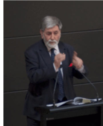
Barry Jones launching the ADB's Endowment Fund