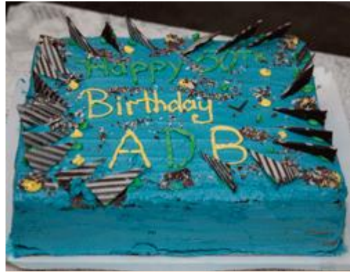
ADB's 50 th Birthday cake