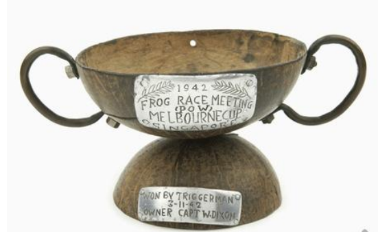
Prisoners of war at the Sime Road POW camp in Singapore held a special frog race Melbourne Cup meeting in 1942

reprinted from the ANU Reporter , Spring 2010