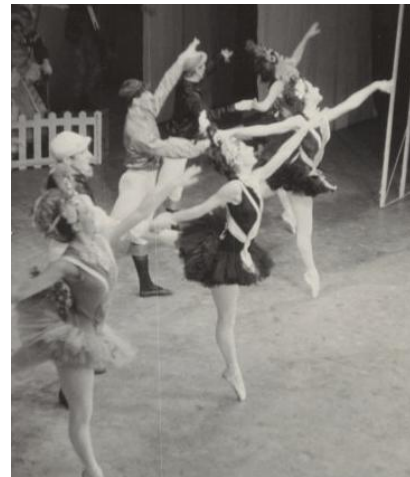
Australian Ballet performance of Melbourne Cup , 1963

The influence of the cup in the political sphere is evident in the ADB's biography of Prime Minister John Curtin (1885-1945): "He was a student of racing form but hardly ever betted, apart from an annual £1 on the Melbourne Cup". Similarly, sport and religion merge where the Melbourne Cup is concerned. In the 1950s Catholic priest John Patrick Pierce (1909- 1970) instituted a Melbourne Cup mass at St Francis's Church. The ADB also reveals the allure of the race for Australians with a creative bent, including the artist